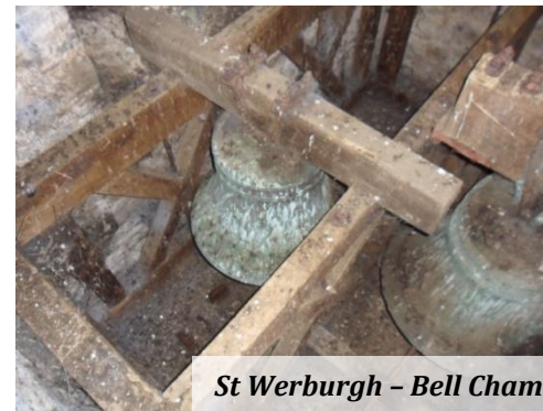
St Werburgh – Bell Chamber before and after repair