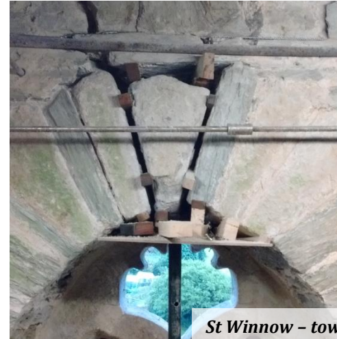
St Winnow – tower window repairs