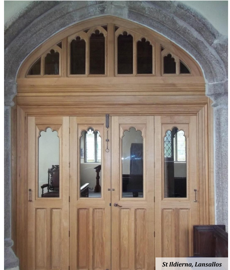
St Ildierna, Lansallos

HISTORIC BUILDING REPAIRS AND RENOVATIONS