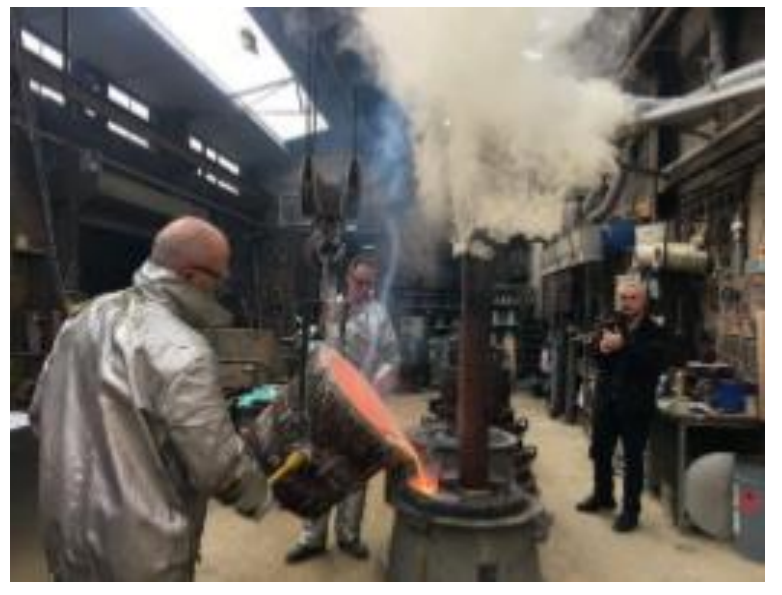
Pouring the melt into the wax moulds...