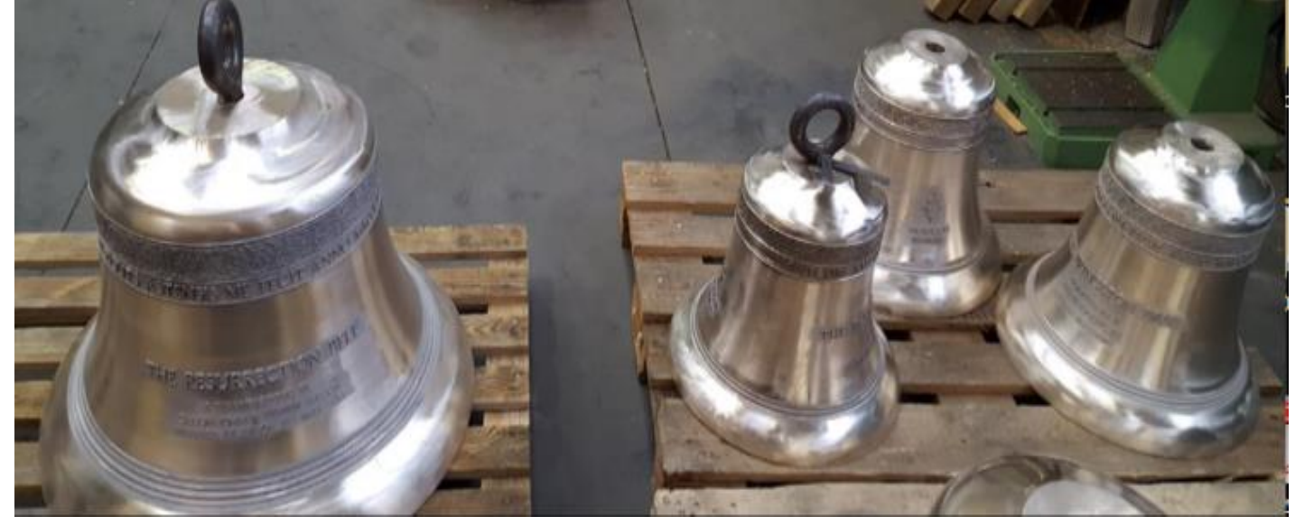
Ta Dah! The Finished product!

Some of our beautiful new bells which will be transported to Nicholson Engineering Ltd who are making the bell components and frame, and hanging our bells at St Winnow in August 2017.