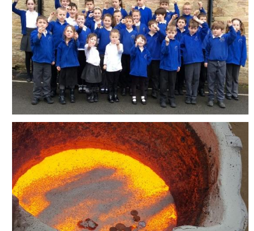
Children from Lerryn school sent pennies to go into the melt in keeping with ancient traditions.