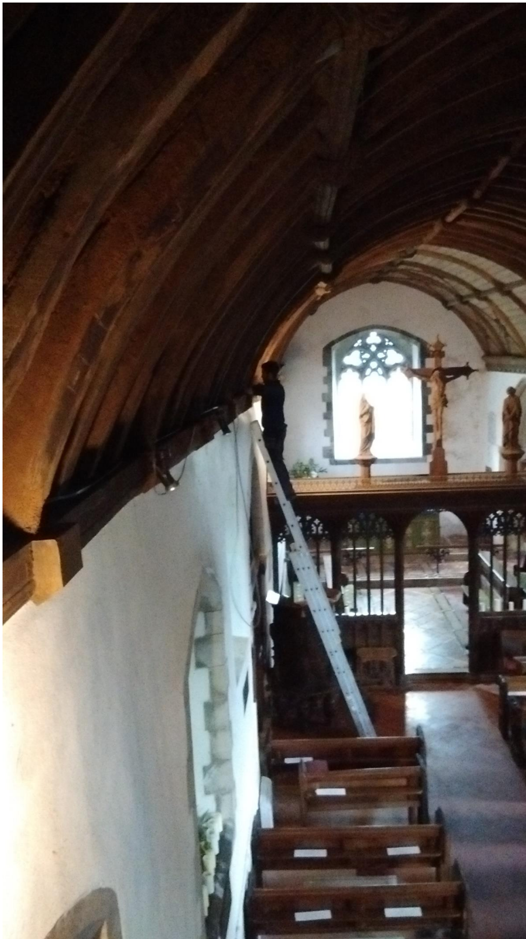
ELECTRICIANS WORKING IN THE AVE