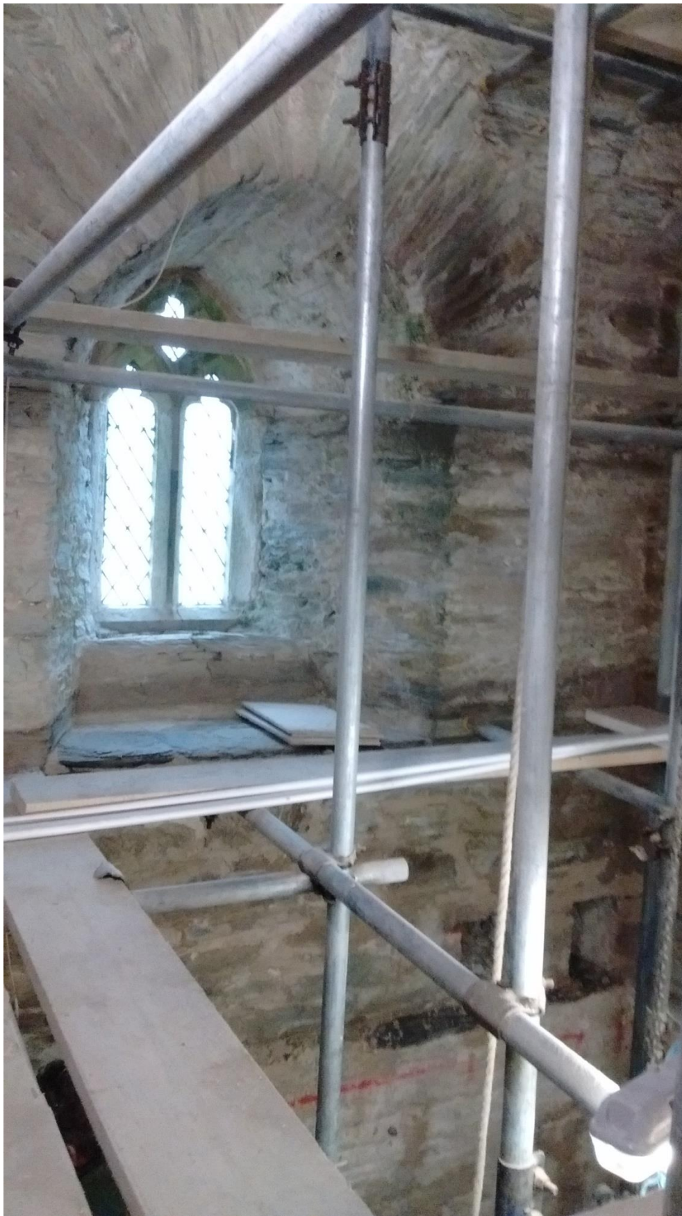
SCAFFOLDING IN THE MID CHAMBER DURING PHASE TWO