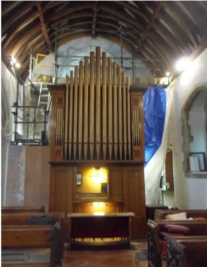
SCAFFOLD BEHIND THE ORGAN TO REPAIR THE ARCH AND REMOVE THE CEMENT RENDER