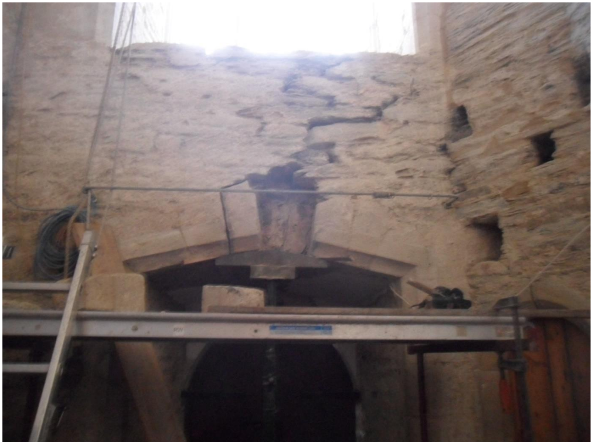
TOWER WEST DOOR ARCH DURING REPAIR