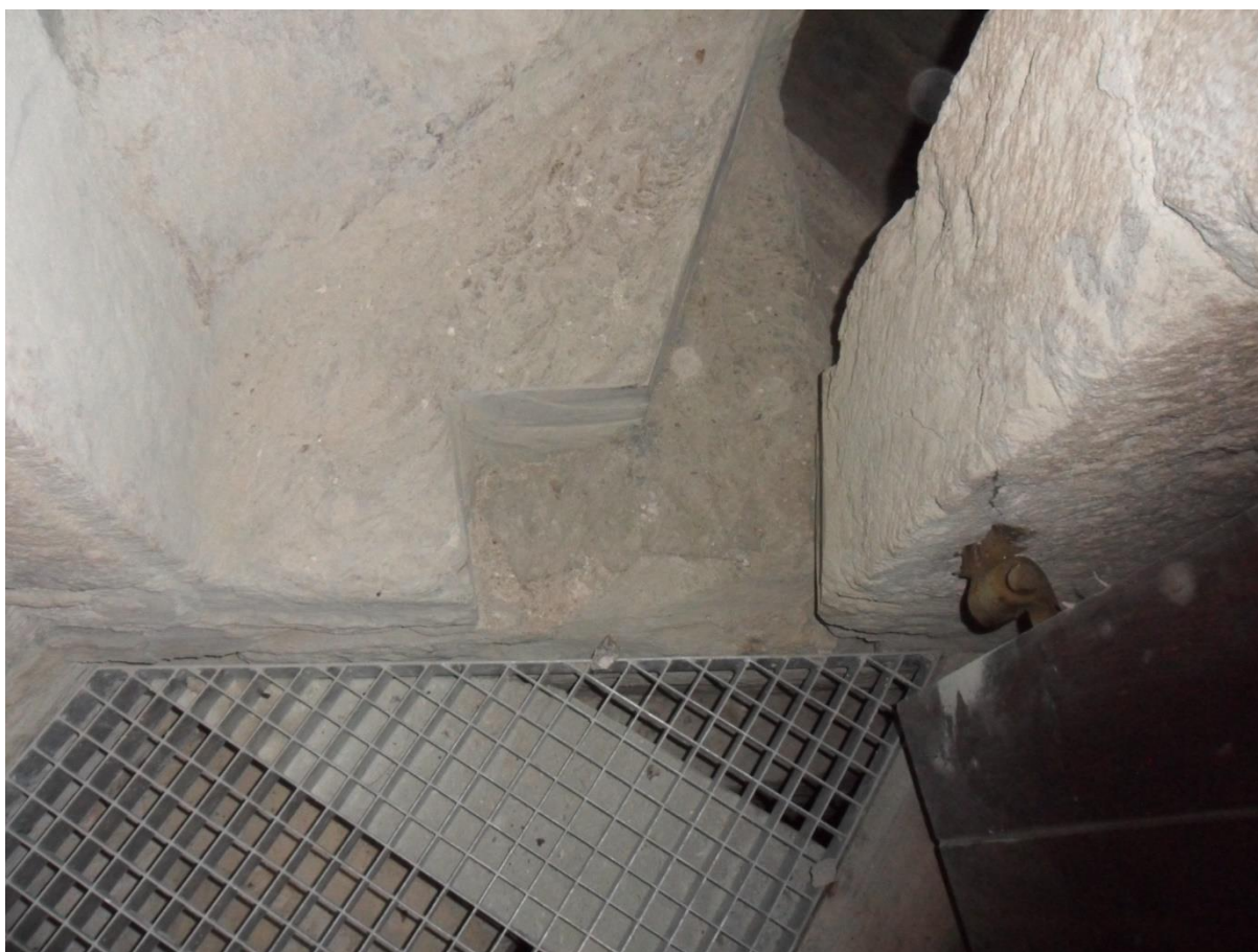
STEP TO OLD BELL CHAMBER FROM TOWER STAIR REPAIRED WITH NEW STONE