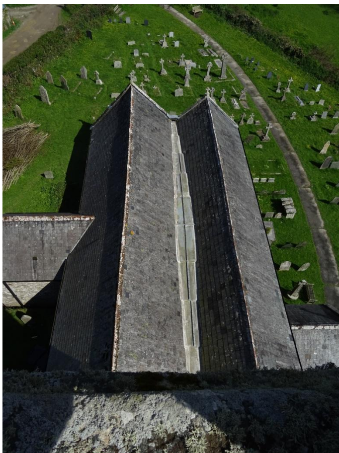
VIEW OF VALLEY FROM TOWER ROOF