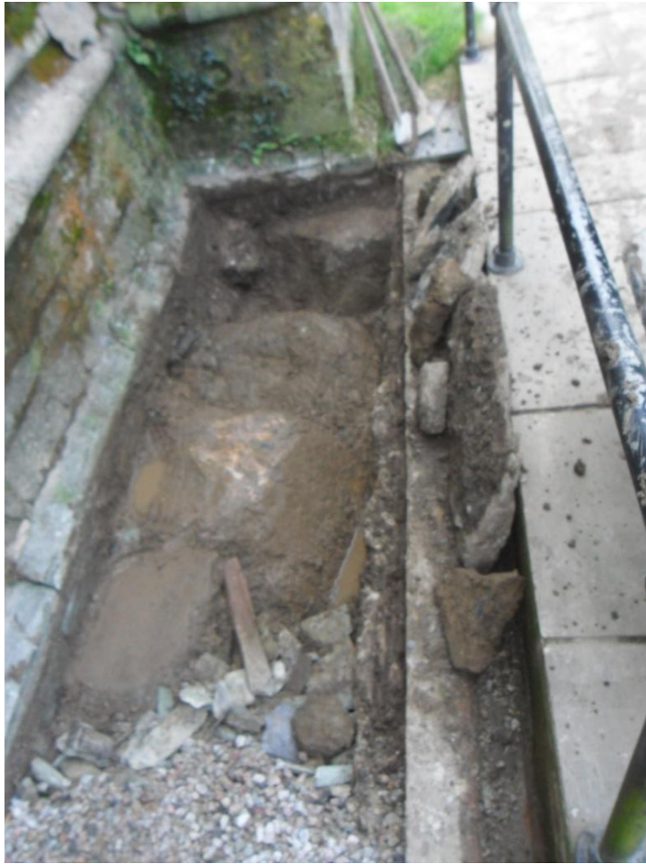
DIGGING THE NEW DRAINS TO THE NORTH AND SOUTH SIDE OF THE TOWER REVEALED THE BEDROCK ON WHICH THE TOWER WAS BUILT