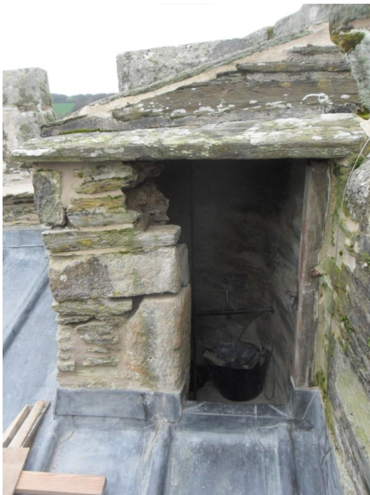
DOOR PINTLE DAMAGE