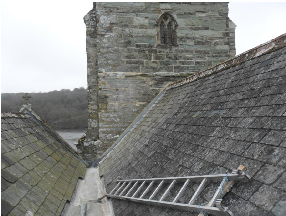
JUNCTION BETWEEN NAVE ROOF AND TOWER REPAIRED & LEAD RE-DRESSED