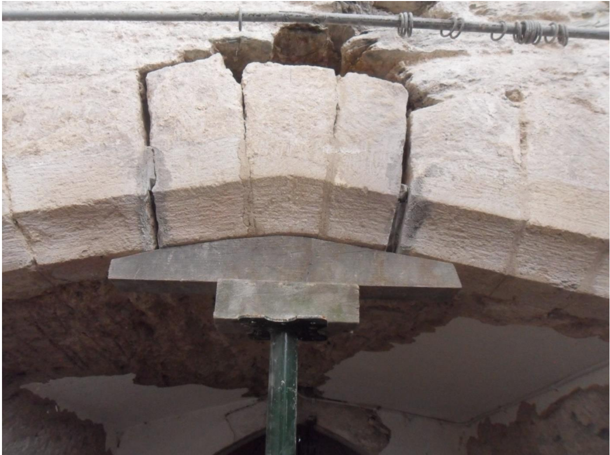
KEY STONES TO TOWER WEST DOOR ARCH HAD DROPPED