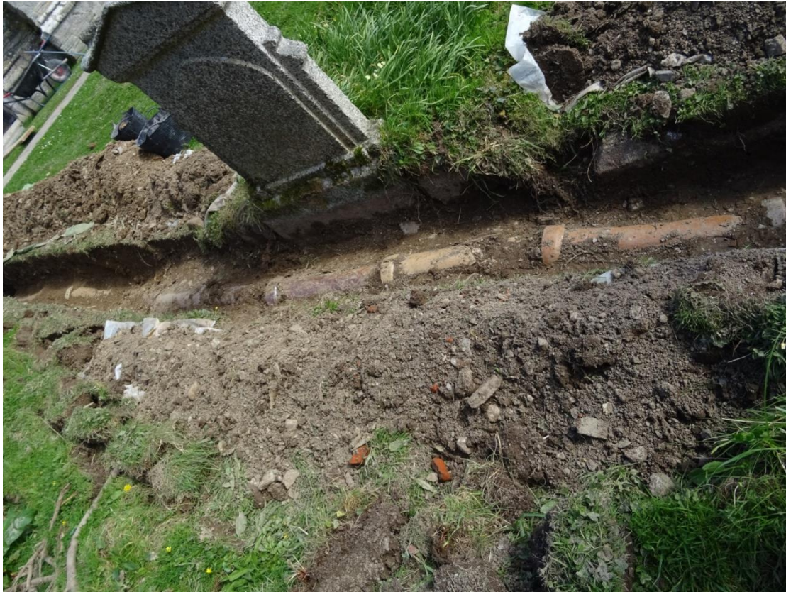
RAINWATER DRAINE FROM TOWER – BLOCKED AND BROKEN CLAY PIPES SETTLED TO IN AN UNEVEN FALL