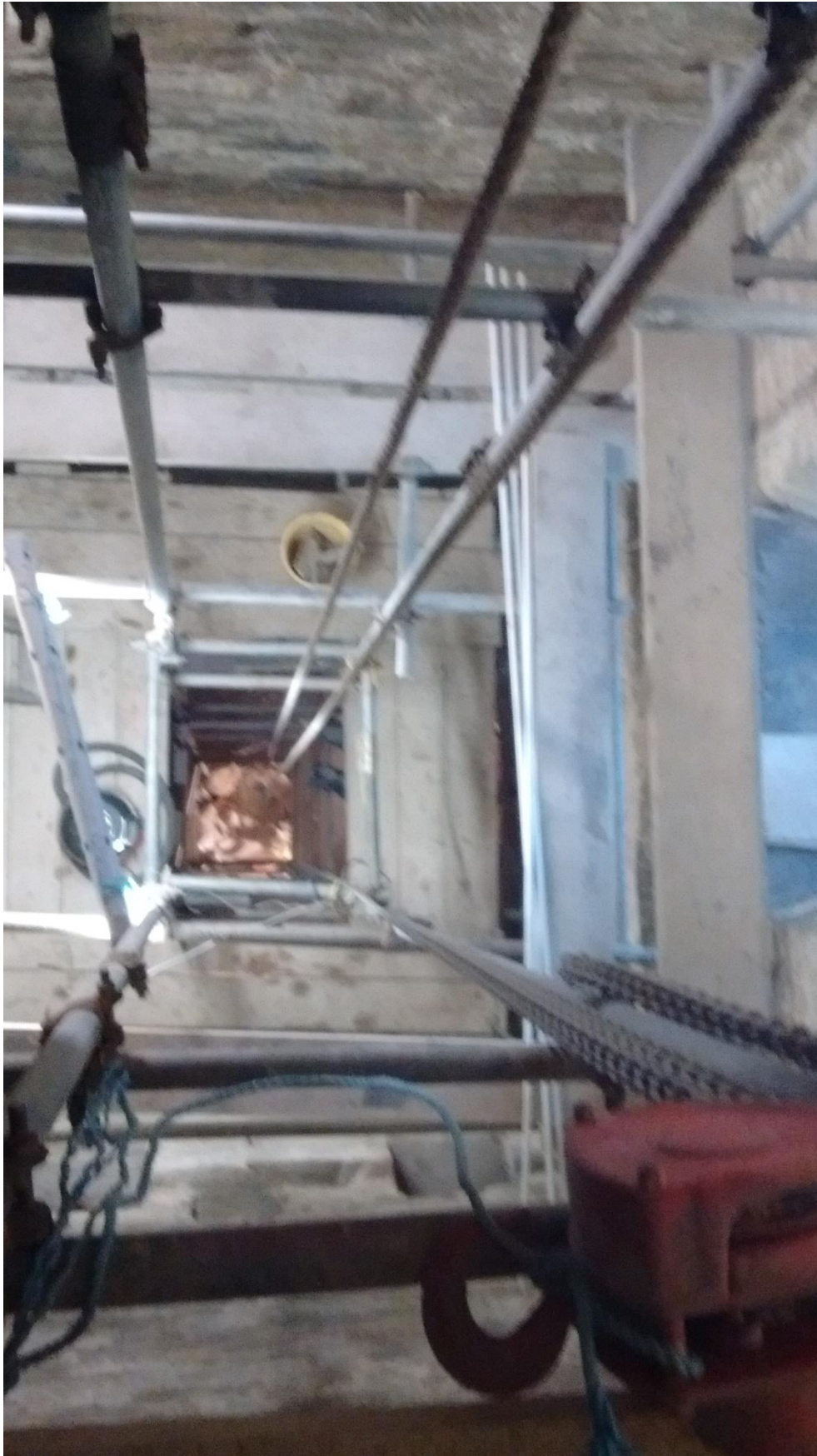
VIEW DOWN THROUGH THE SCAFFOLDING