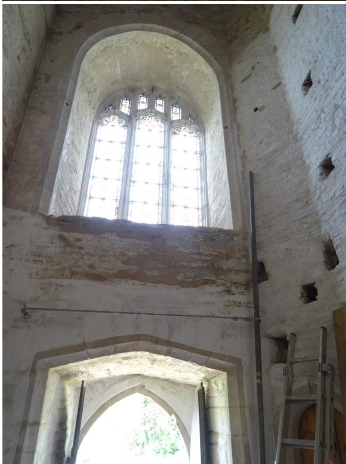
SILL & ARCH AFTER REPAIR