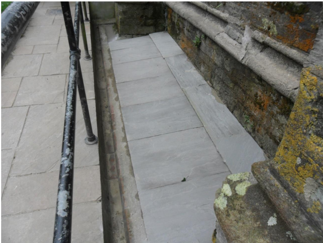
DRAINS NOW FILLED WITH GRAVEL & SURFACED WITH LIME STONE