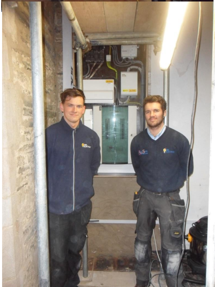
THE ELECTRICALS MOVED AND UPDATED THE ELECTRICAL PANEL FROM THE TOWER TO A NEW CUPBOARD AT THE WEST END OF THE NAVE